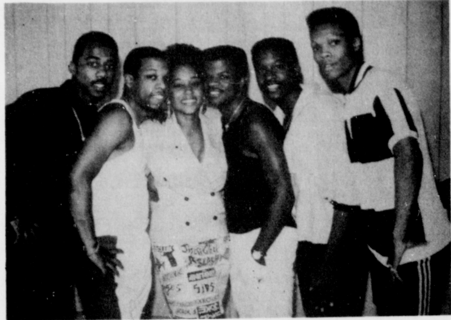
"Candy Girl" and "Cool It Now," hit singles from the teen days of the R&B group, New Edition, reflect the group's more relaxed attitude about life. However, the group says it got "spanked" by the music industry, prompting them to get more serious about their careers. They now vow that their latest album, "Heartbreak," signals that they are "better and stronger than ever before." New Edition also exchanges compliments about Minneapolis producers Jimmy Jam and Terry Lewis, who brought out what the duo calls New Edition's "on-tap" talent to produce "Heartbreak."