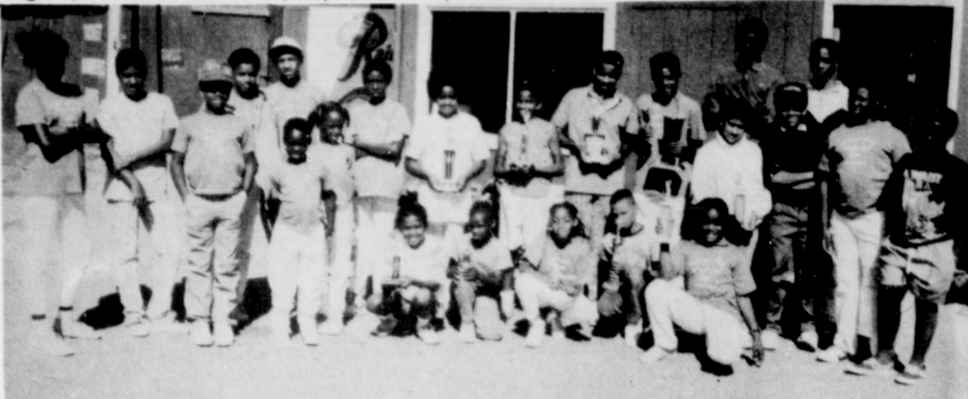
On Sept. 10, The Leisure Hour Golf Club sponsored a golf competition between young golfers from Seattle and Portland. Everyone was a winner! Story on The Leisure Hour Golf Club will be forthcoming.