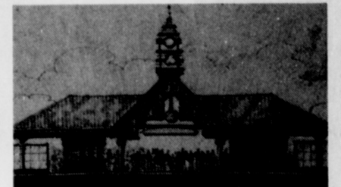
The new Beaverton Transit Center is the hub of westside bus service and designed to serve future light rail passengers.

Tri-Met is planning more Park & Ride lots and Transit Centers for your convenience.