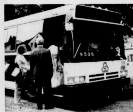
The new buses are smooth, quiet and comfortable.