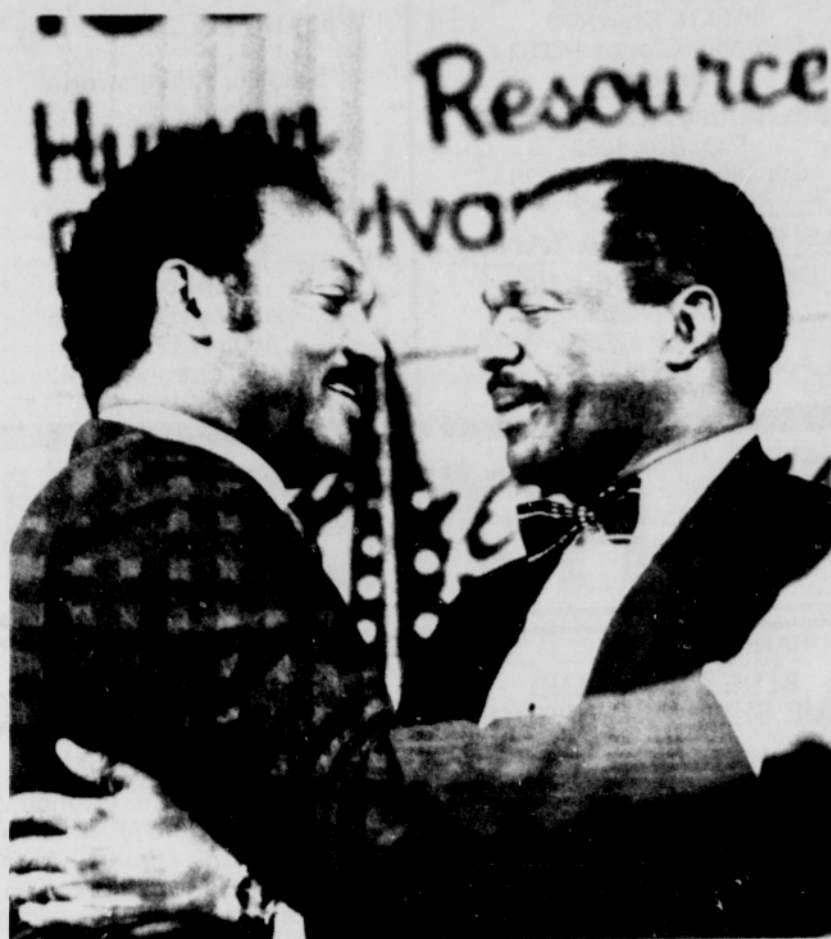
The Rev. Jesse Jackson (left) congratulates Mayor Marion Barry of Washington, D.C., who was honored at the "Tribute to a Black American" dinner, a highlight of the 14th Annual Convention of the National Conference of Black Mayors, Inc.

During the convention, Washington, D.C., mayor, Marion Barry, was honored at a special "Tribute to a Black American" dinner for his outstanding achievements as a former president of the conference.