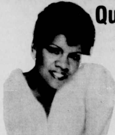
by B.J. Edwards

Mode! ... Mode! ... Mode! ... Fashion! ... Fashion! ... Fashion! It's a continuous conversational topic, and the focus heightens with escalating prices. Retailers are sticking hefty prices on garments that are below standards.