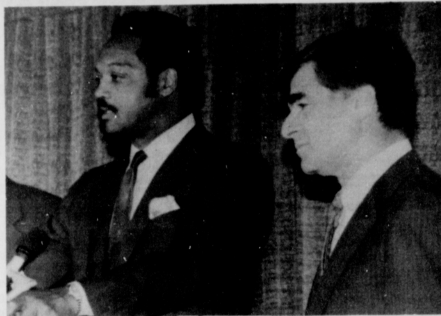
A TRUCE FOR VICTORY —Rev. Jesse Jackson, who made history as a serious candidate for the Democratic presidential nomination, joined Democratic presidential nominee, Gov. Michael Dukakis to announce an agreement to work cooperatively to regain the White House in the fall. Also participating in the press conference at the recent Democratic National Convention was Senator Lloyd Bentsen, who was nominated for the second spot on the Democratic ticket. Although Jackson did not win the nomination, he achieved a significant victory in the process of political empowerment for Black Americans.

All of the workshops will be held on the Spelman campus in Atlanta.