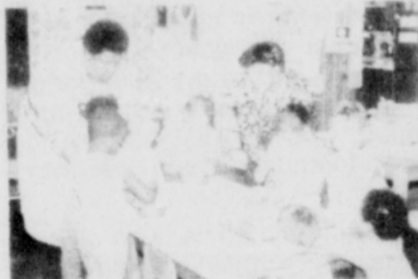
4 Year Olds - Making Cookies