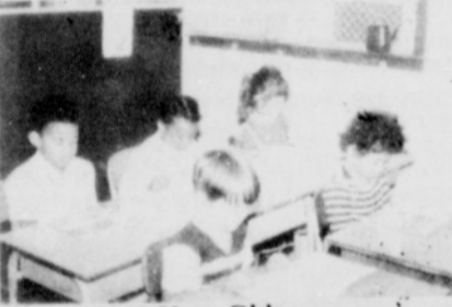
5 Year Olds - Reading First Grade Books