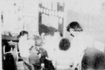
2-1/2 Year Olds - Learning Shapes