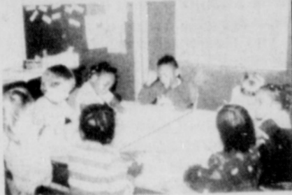
3 Years - Writing ABC's