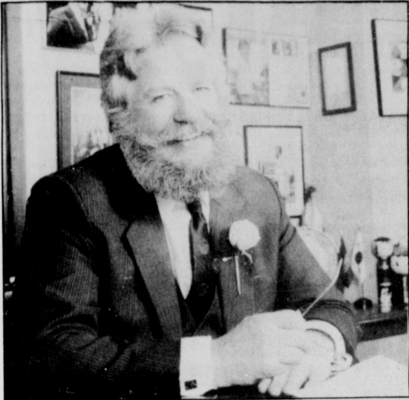
Portland Mayor Bud Clark

"Summary of Police Deployment of Anti-Gang Resources"