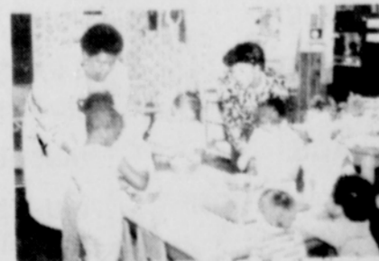
4 Year Olds - Making Cookies