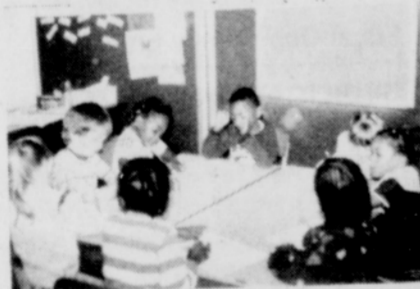
3 Years - Writing ABC's