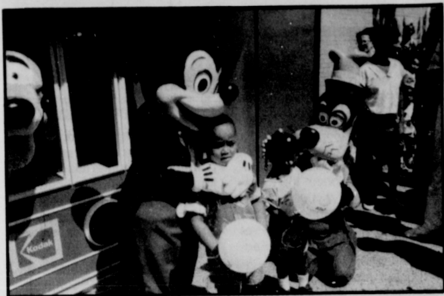
WALT DISNEY WORLD CHARACTERS PRESENTED BY KODAK —Walt Disney World characters Mickey Mouse and Goofy play an active role as part of Eastman Kodak Company's participation in various Black events during 1988. Here, Mickey and Goofy pose for pictures in a specially-designed picture-taking area provided by Kodak. Tigger, another character, is on the left. Kodak will present the characters at the Black Arts and Cultural Festival in Albany, N.Y., July 24, Harlem Week, New York City, Aug. 21, and the National Black Family Reunion, Washington, D.C., Sept. 10-11, 1988.