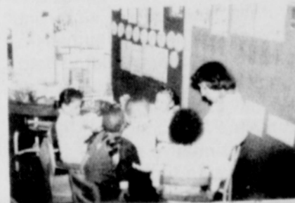
2-1/2 Year Olds - Learning Shapes