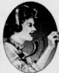
We've been helping friends and neighbors talk to each other since the turn of the century.

Over the years, one name has been connecting you with neighbors, businesses and the world. That name is Pacific Northwest Bell.