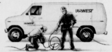
The people you've counted on for reliable service will still be here.

The strong values, sense of caring and spirit of innovation we believed in back at the turn of the century, we still believe today. That will never change.