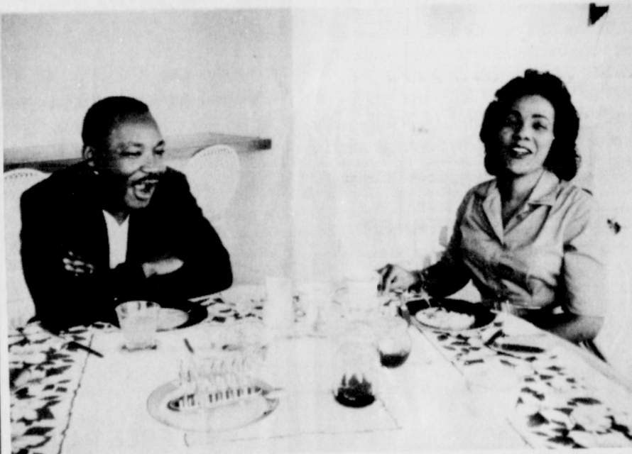
"A picture is worth a thousand words," is the best way to describe the above photo of Rev. and Mrs. Martin Luther King. This rare photo is from the collection of Johnson Publishing Company, Publishers of EBONY and JET Magazines.