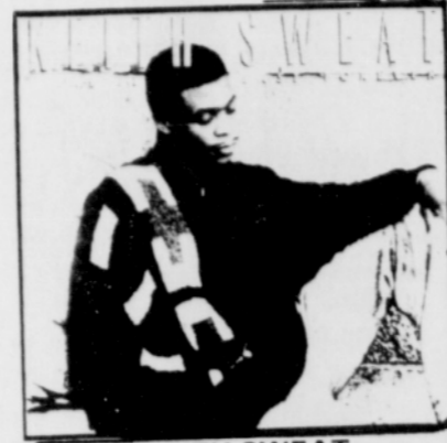
KEITH SWEAT "MAKE IT LAST FOREVER"