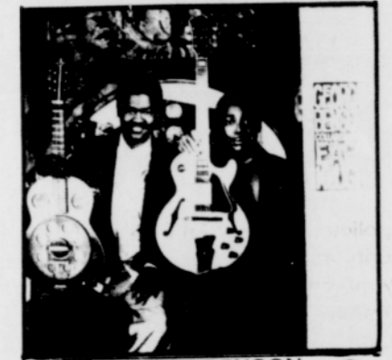
GEORGE BENSON EARL KLUGH "COLLABORATION"