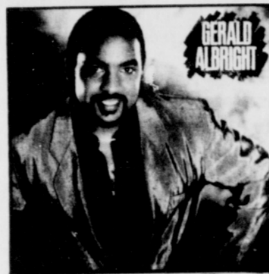
GERALD ALBRIGHT "JUST BETWEEN US"