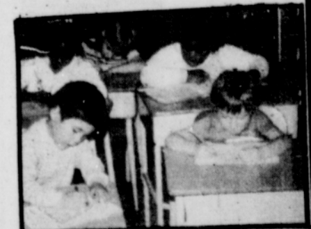
5-year old kids at Grace Collins study hard on school work before going outside to play.