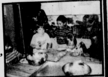
4-year old kids at Grace Collins Memorial Center learn how to make cookies.