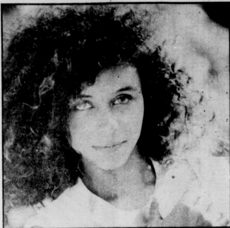
Troy Beyer, of "Dynasty" fame, reveals how she recovered from a troubled childhood to find success in acting.

Beyer, whose acting credits include Showtime Cable's "Uncle Tom's Cabin" and the movie, "Disorderlies," says of her career, "I don't want to be a star, I want to be an artist." The socially conscious actress also wants to help troubled teens and become a U.S. senator one day to "give something back" to the world.