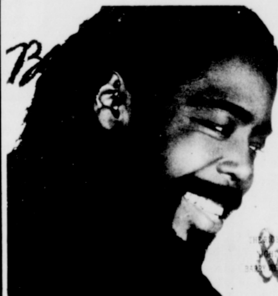
BARRY WHITE "The Right Night and Barry White"