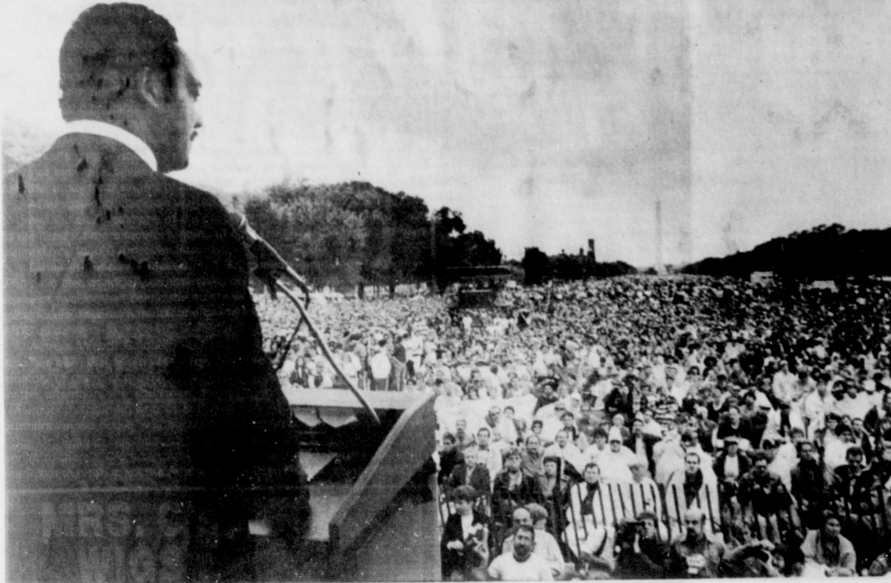
Rev. Jesse Jackson speaking to lesbians and gays at the national march on Washington — "Today I stand with you; on election day you stand with me."