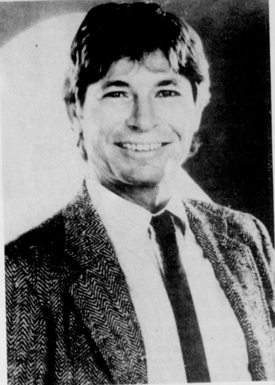
John Denver, in concert, Oct. 1, at the University of Portland.

J.B.'s Paradise Room 3530 N. Vancouver Ave. 288-1196