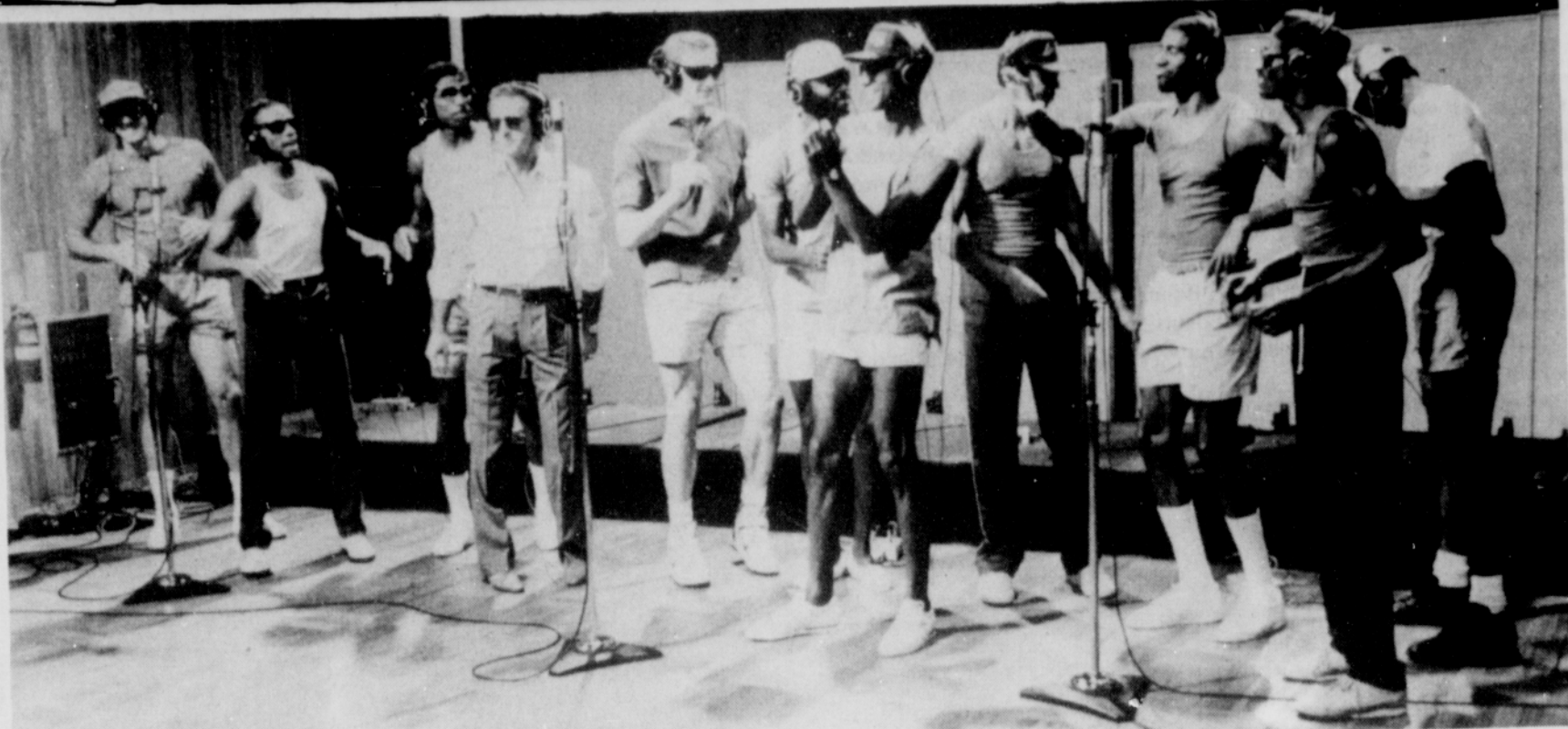
Los Angeles Lakers recording session for "Just Say No". (L-R) Kurt Rambis, Byron Scott, A.C. Green, Pat Riley, Mike Smrek, James