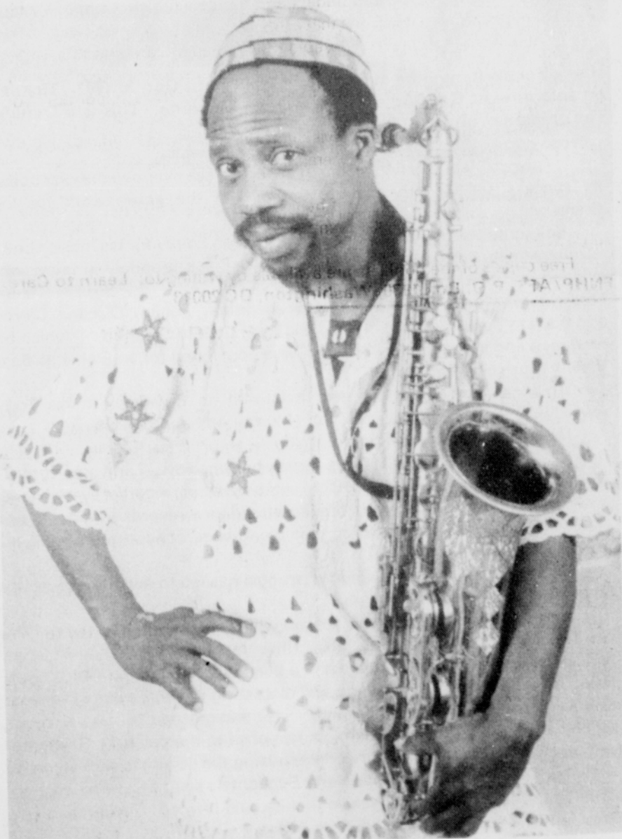
O.J. Ekemode, an Afro-beat pioneer.