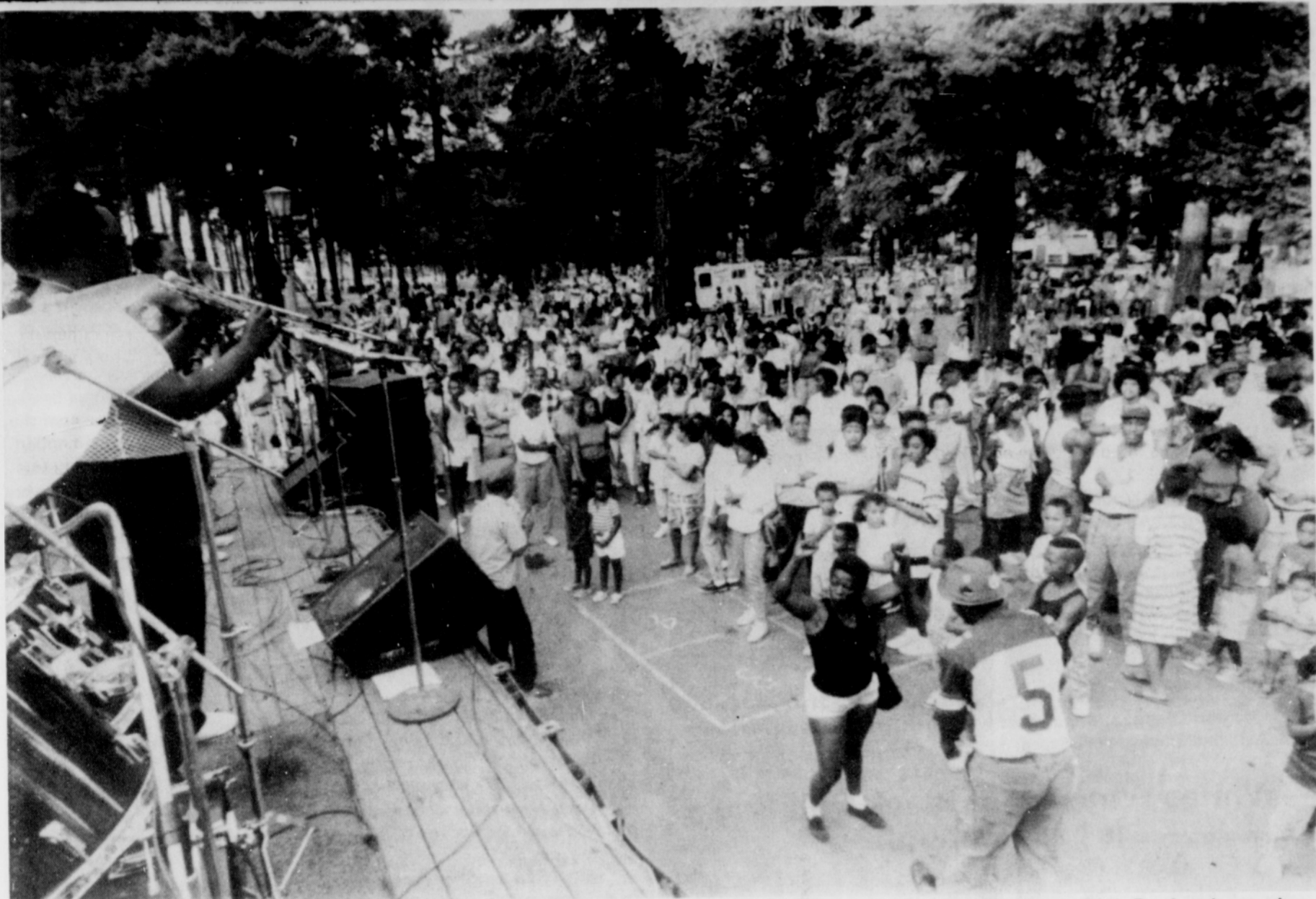
Over a thousand people turned out for the "End of Summer Jam and Picnic Monday at Alberta Park. The event brought people out young and old, in what organizers called a very successful day. The