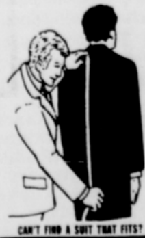
CAN'T FIND A SUIT THAT FITS?