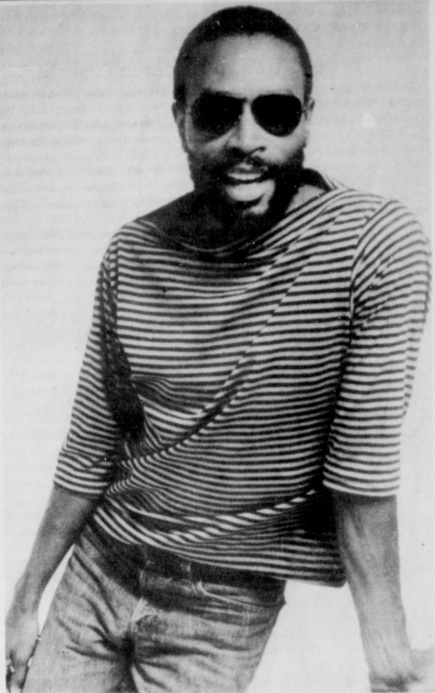
Bobby McFerrin Jazz Vocalist