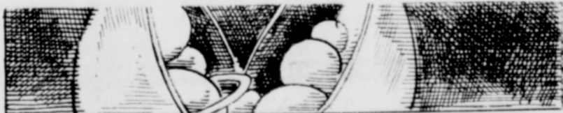
All of the other planets in our solar system could be placed inside the planet Jupiter.

YES! to job opportunities close to where we live . . . and YES! to everything else that's part of the GOOD LIFE . . . the life we hope and pray to pass along to the next generation. Thank you.