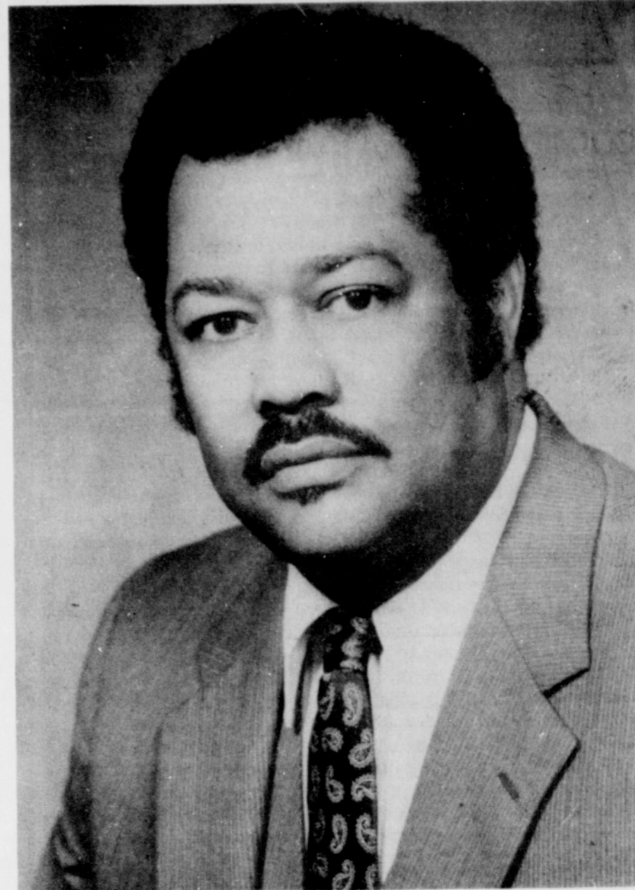
Pluria Marshall, chairman of the National Black Media Coalition.

Los Angeles-based DJMC is one of the largest independent advertising agencies in the West, with billings approaching $130 million. DJMC/Portland is located at 101 S.W. Main St., Portland, Ore.