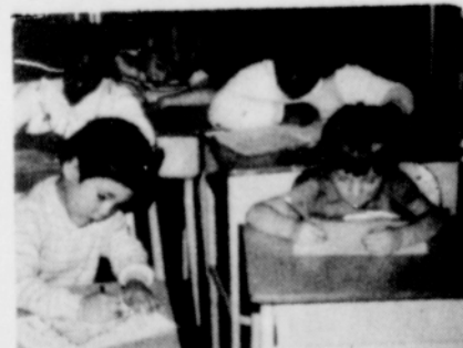
5-year old kids at Grace Collins study hard on school work before going outside to play.