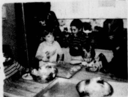
4-year old kids at Grace Collins Memorial Center learn how to make cookies.