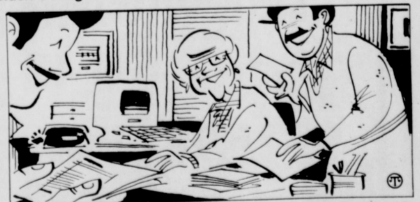
College students are making the difference in the lives of many older Americans these days.

About one-third of the 103 HBCUs have undergraduate or graduate gerontology training, research or community service programs. Through its Initiative, AoA is attempting to expand the number and improve the quality of these programs. Financial support and improved collaboration between HBCUs has enhanced many gerontology programs at Black col-