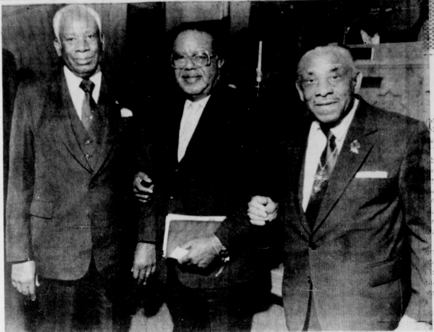
Dr. Ralph D. Abernathy, Pastor, West Hunter Street Baptist Church, Atlanta, Georgia, was in Portland this past weekend. Dr. Abernathy, who is the current president of the Southern Christian Leadership Conference, participated in services held at Vancouver Avenue First Baptist Church

Because of the many franchising questions prospective franchisees have, I'll be happy to answer one question about franchising to anyone who sends a stamped, self-addressed envelope to: Franchise Learning & Consulting Ctr. Ltd., Dept. S, 20 Lattingtown Road, Glen Cove, NY 11542.