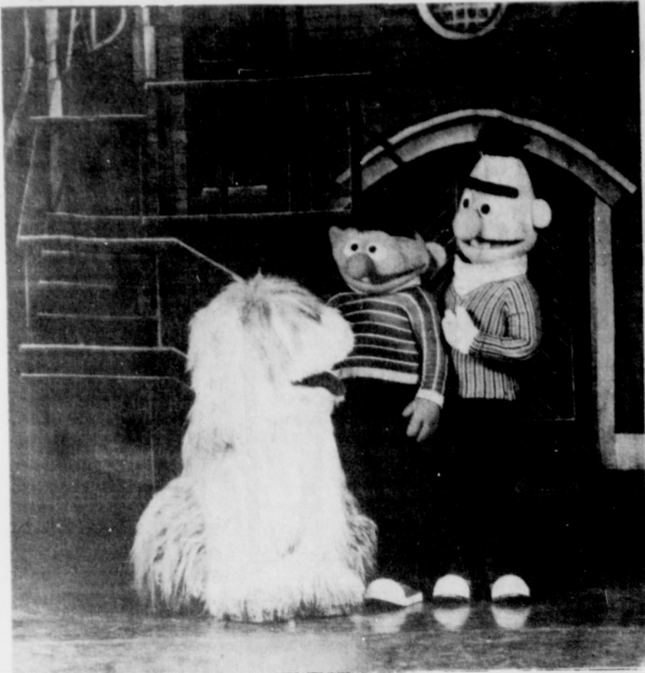
Barkley and buddies Bert & Ernie in scene from SESAME STREET LIVE , at Portland Coliseum, June 17-21.