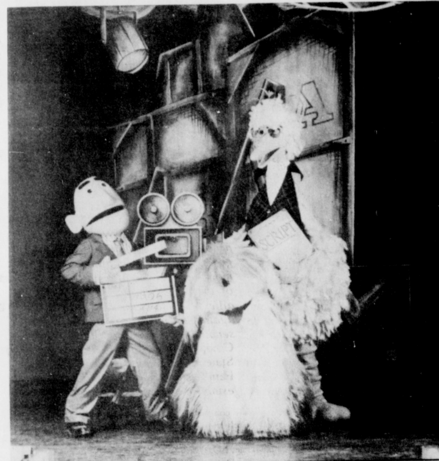
Big Bird, Guy Smiley and Barkley the Dog in SESAME STREET LIVE at Portland Coliseum Wed.-Sun., June 17-21.