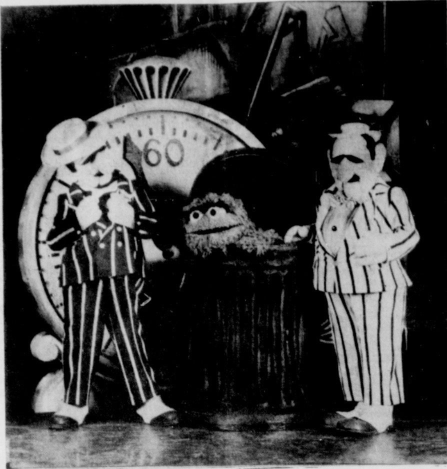
Izzie Great & Wuzzy Wonderful meet Oscar the Grouch in SESAME STREET LIVE , June 17-21 at Portland Coliseum.