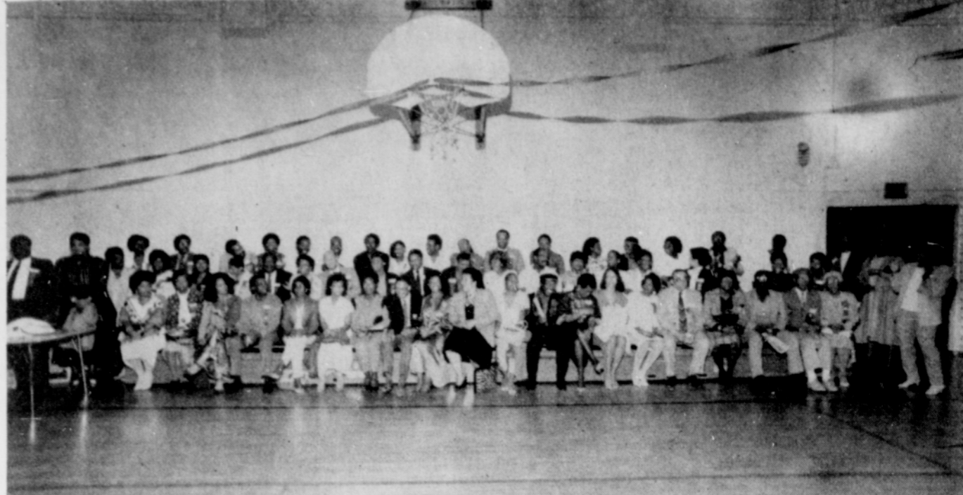
The climax to the Eliot School Reunion was the singing of "We Are The World" by the former stu-