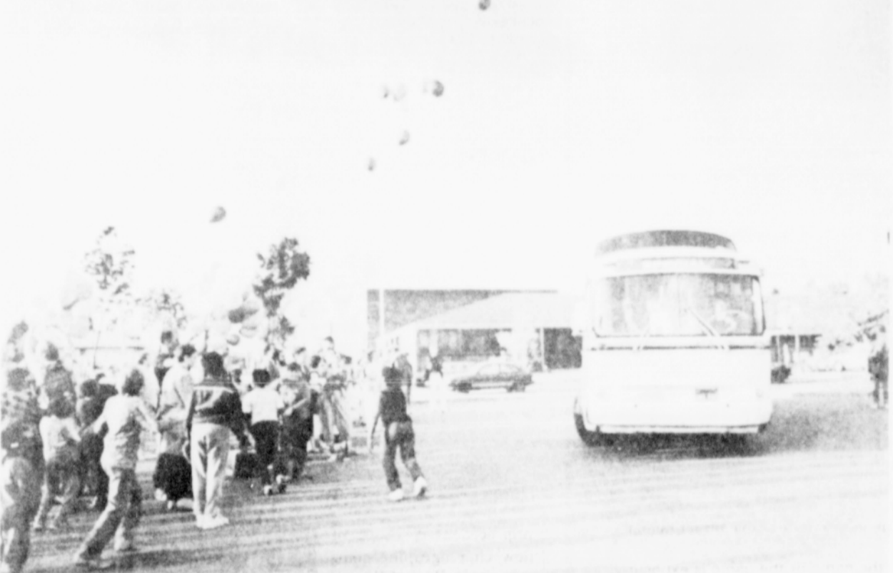
A busload of Portlanders left for San Francisco Friday following a rally held at King Neighborhood Facility. In San Francisco, the Portlanders joined thousands of others demonstrating against apar-

theid and U.S. intervention in Central America. Simultaneously, a demonstration was held in Washington, D.C.