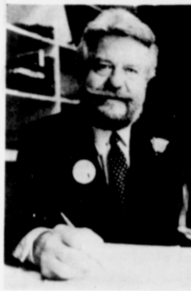
Mayor Bud Clark

Also scheduled are the Sojourner Truth Theater performing character-