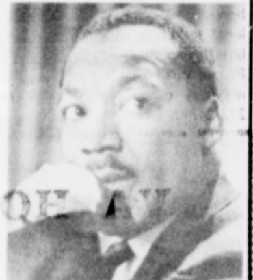
(My Dream, Your Reality)