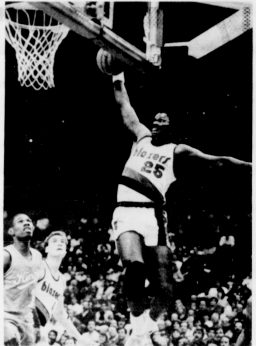
Jerome Kersey, always a crowd pleaser, soars to the basket during the Blazers' 128-111 win over the Sacramento Kings at the Memorial Coliseum Sunday.

The American Red Cross Mobile Unit is sponsored by the Meridian Park Hospital Auxiliary.