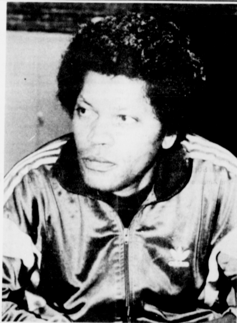
Clarence Williams III

Although he is remembered for his hit TV series "The Mod Squad," Clarence Williams III has given current credence to his talents playing the role of the father in pop-star Prince's award-winning motion picture, "Purple Rain." Williams, who was born in Harlem, made his Broadway debut in "The Long Dream." His other stage appearances include: "Double Take," "The Great Indoors," Shakespeare's "King John," and the 1964 play that established him in New York theatre, "Slow Dance On The Killing Ground." Williams was chosen for the 1968 premier of "The Mod Squad" after being recommended by his good friend Bill Cosby and appearing in a Danny Thomas special, which served as a screen test for the TV series. The series lasted for five seasons. His other TV appearances include: The Hero Who Couldn't Read, "Hill Street Blues" and "T.J. Hooker."