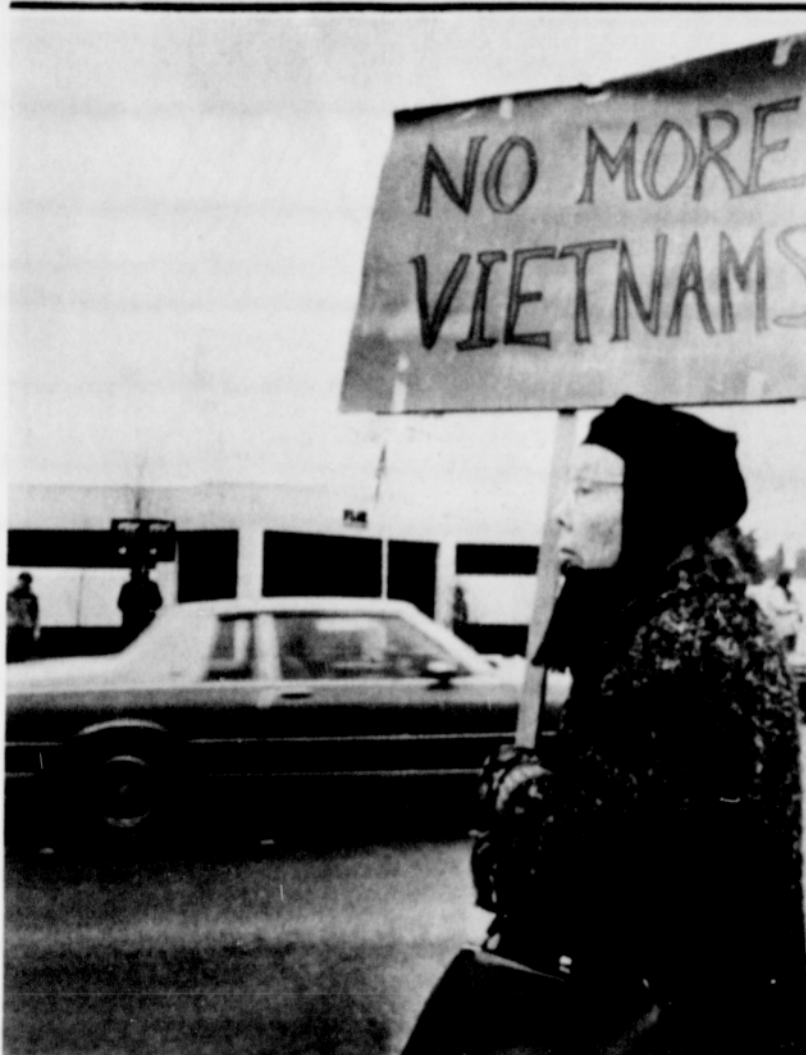
Protesters picketed at FLIR Systems, Inc., in Tigard last Thursday. FLIR Systems, Inc., manufactures infra-red night vision scanners and the company has sold four of the units to the El Salvadorian Air Force. The units are mounted on helicopters and used to detect body heat to aid in the machine gunning and bombing of civilians in El Salvador.