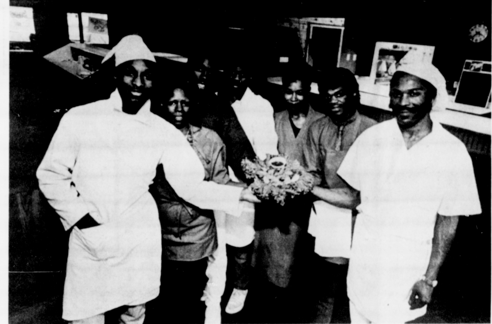
Hiram's Shrimp Shop opened this weekend in Union Square. The shop offers a menu of assorted seafood in a very pleasant atomos-