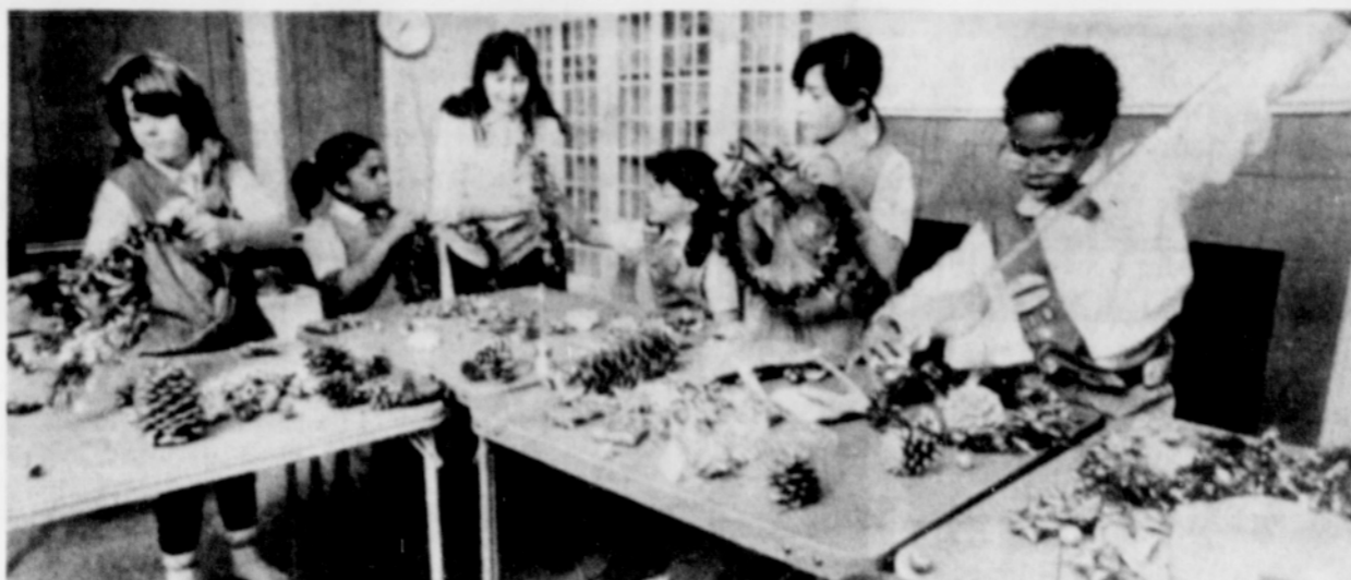
Girl Scouts, from troop 009 of North Portland, make Christmas wreaths for residents of Dell's Care Center as one of the many projects they have during the year. The troop meets every Tuesday

Why has nothing been done? If something has been discovered, why hasn't the public heard? The violence and harassment at abortion clinics has escalated. The legal and justice systems continue to do little to protect a woman's rights to choice. Ask "WHY?" on the anniversary of the bomb attempts: Dec. 2, 1986.