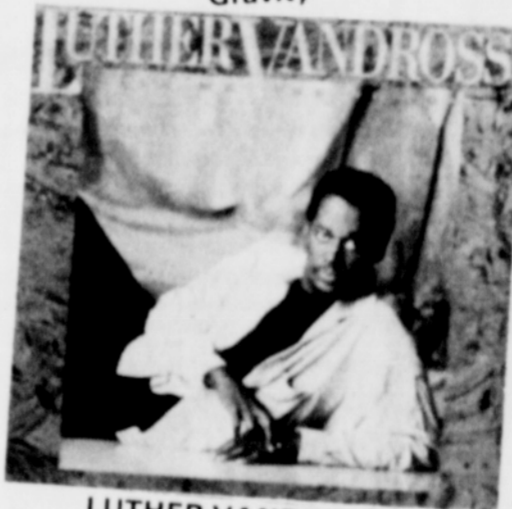
LUTHER VANDROSS "Give Me The Reason"