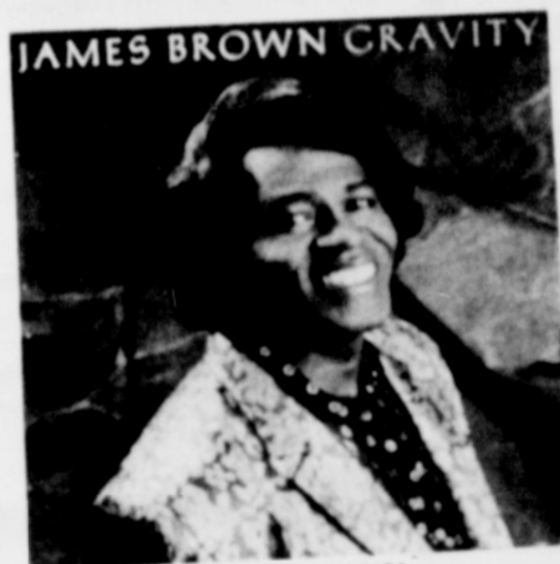
JAMES BROWN "Gravity"