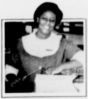
"I want people to know they can depend on me and that

"I want people to see me and say- 'Look, she came from here and she made it.' And I want them to make it too!'