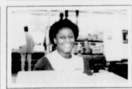
I've worked at the Gresham Fred Meyer City stores, too, but, I'll always come back to Walnut Park because the people here are

The Walnut Park Fred Meyer One-Stop Shopping Center is located at 5408 N.E. Union Ave. Open 9AM to 10PM 7 Days A Week