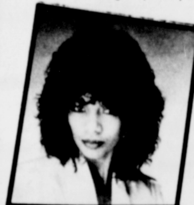
It's New Angel

(long or specialty styles slightly higher)