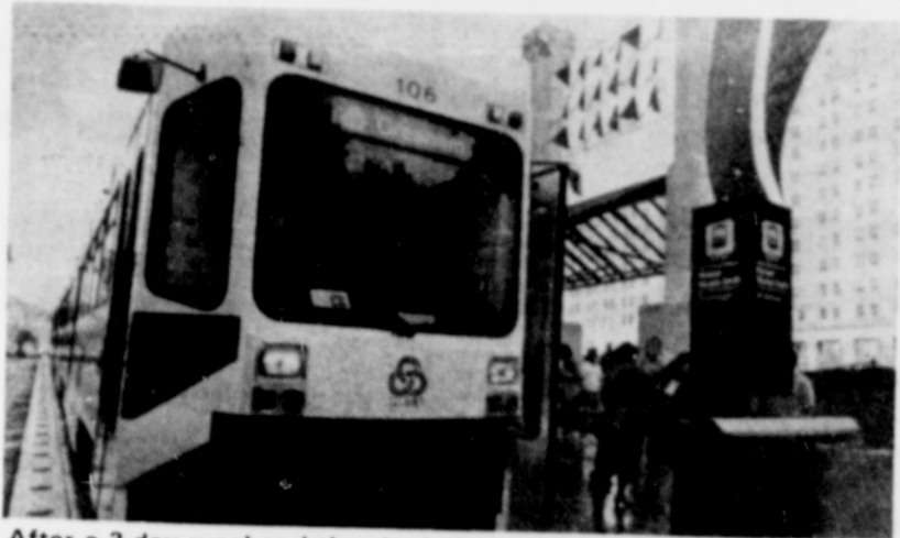
After a 3-day weekend that had about 200,000 people riding MAX, exceeding the expectations of Tri-Met, the light rail is off and running. Except for a few minor delays and a downtown Portland accident with an automobile in which there were no injuries, MAX stayed pretty much on schedule. Commuters relaxed as they passed the bottle-neck of traffic on the Banfield.