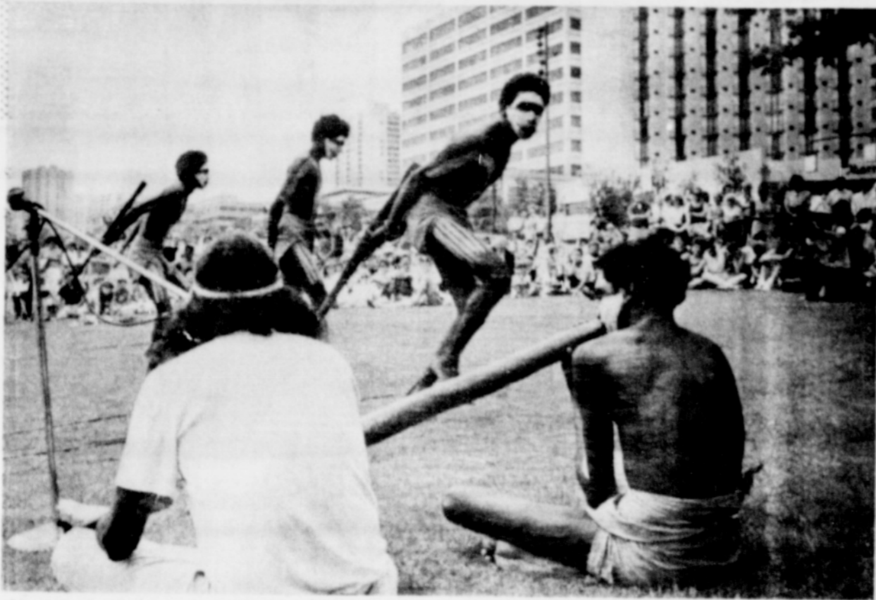
Aboriginal culture of Australia visited Portland in the form of dance and music, neither of which much is known outside of Australia and New Zealand. A free outdoor performance by aboriginal dancers and musicians from north Australia