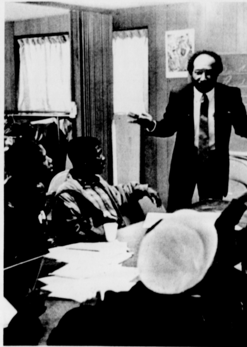
Saturday April 12, 1986 at Mt. Olivet Baptist Church the Tri-County Section of National Council of Negro Women sponsored a Youth Awareness Workshop. The workshop attracted young people from the ages of 13-21 and covered subjects concerned with Problems with Being Young, Personal Appearance, Personal Finance and Accounting. Above Leslie Hurst, Comptroller of the Currency with the U.S. Treasury Dept. talks to one of the groups about personal finance and consumer tips.