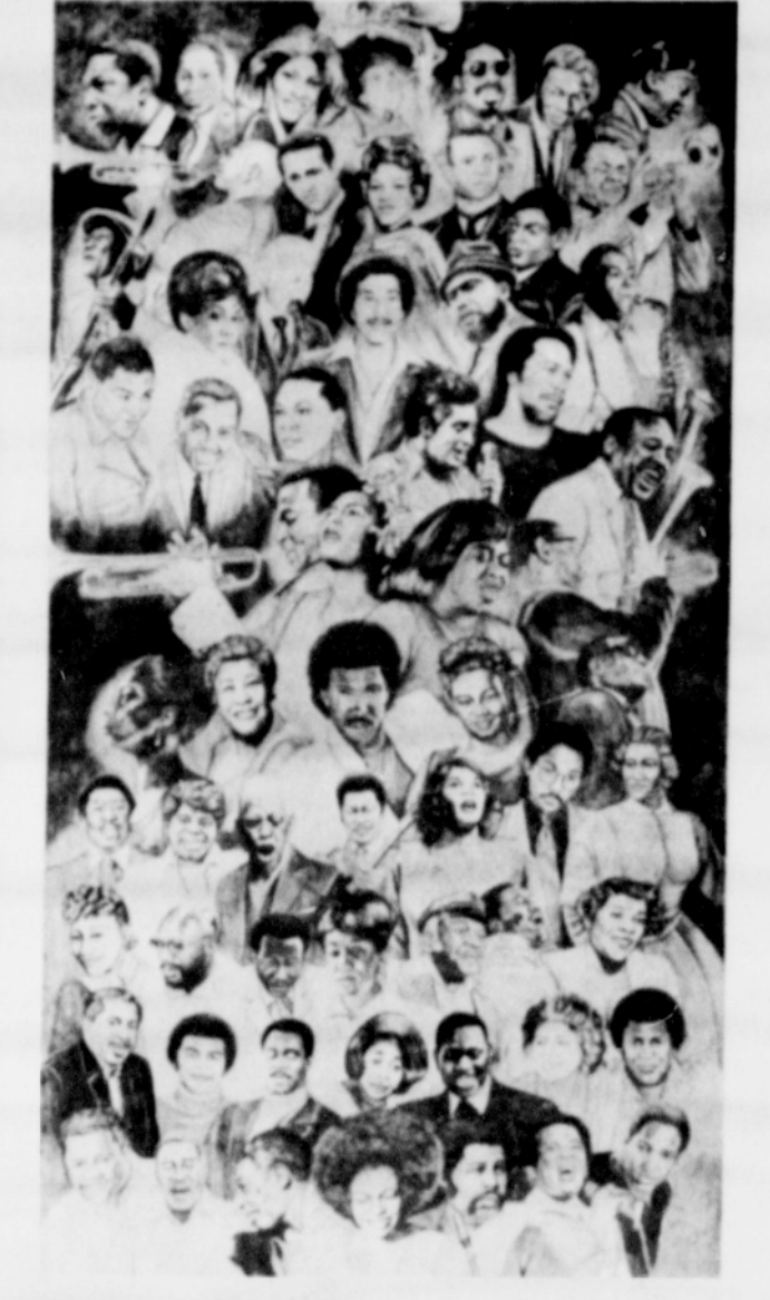
The Nabisco Brands "Famous Black American Entertainers" posters applaud blacks' contributions to the performing arts. The two posters, which spotlight 119 actors, dancers, musicians and singers, are distributed free of charge. To order, contact: the Portland Observer newspaper, 288-0033, 1463 N.E. Killingsworth. Posters can be picked up at the Portland Observer after March 15th, 1986.

Entertainers are the latest addition to Nabisco Brands' "Famous Black Americans" poster series. The series began in 1978 with educators. Subsequent editions recognized writers, scientists and generals and admirals. The educational posters are distributed free of charge.