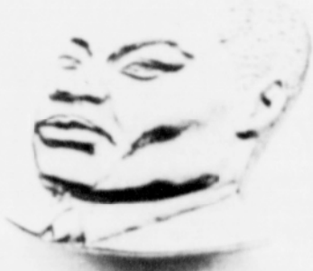
The Martin Luther King, Jr. Inaugural Pin.

For information about purchasing the fine jewelry, write Famous Faces, Inc., P.O. Box 2421, Mt. Vernon, New York, NY 10550.