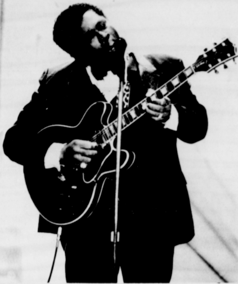
The King of the Blues, B.B. King with his guitar "Lucille" appears on the 1985 "Lou Rawls Parade of Stars." It will be the second appearance by King during the six years of the program. The program airs Saturday, Dec. 28 from 8:30 p.m. to 1:30 a.m. on KPTV-12. Support the United Negro College Fund—"A mind is a terrible thing to waste."