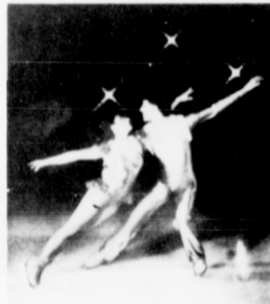
1984 Olympic Silver Medalists Kitty and Peter Carruthers star in Ice Capades' newest revue. Unveiling their original and gravity defying moves, this strong, energetic brother and sister duo have an insatiable desire to attempt the new and daring.

Nov. 30, 2-5 p.m., Trailblazer Mychal Thompson and a group of his Trailblazer buddies will lead off a Dribble Marathon Benefit for Western Youth Ranch, a new concept in dealing with juvenile delinquency. The Dribble Marathon will include dribblers of all ages, who have each collected sponsorships to aid in the development of the Ranch. Free basketballs and T-shirts will be provided for the participants to use and keep. Special contests and events mean everyone has a chance to win some of the many prizes. Call 222-0070 for further details or pick up entry forms at Plaid Pantry stores.