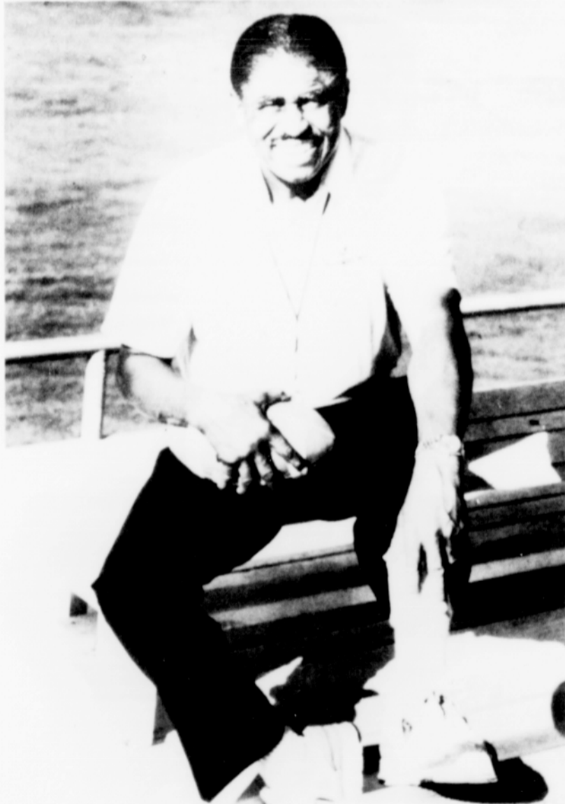
Coach Eddie Robinson is a living sports legend as football's winningest coach and 44 years of success for Grambling State University.

United Grocers, Inc. is a retailer-owned cooperative serving more than 340 retail member stores throughout Oregon, southwest Washington, and northern California. The company operates distribution centers in Portland and Medford. It is best known by its advertising groups Thriftway Stores, Sentry Markets, A.G. Markets, Food Warehouse, or by individual store names such as Strohecker's, Kienow's, Wizer's, Murphy's, Duffy's, Meister's, Wagner's, and other fine independent grocers.