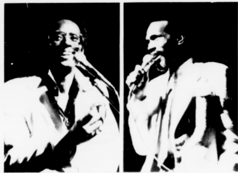
David Ruffin (left) and Eddie Kendrick

"Soul Sensations" (former lead singers of The Temptations) Eddie Kendrick and David Ruffin will be appearing on Friday, Nov. 29 for two shows, 8:00 and 11:00 p.m. at the Starrynight, 8 N.W. 6th, 227-0071. Tickets are $14.75 in advance and available at G.I. Joe's-Jean Machine, Music Millennium, 2nd Ave. Records, Everybody's (N. Lombard), BASS, and the House of Sound Records. A portion of the proceeds will be donated to Portlanders Organized for Southern African Freedom.