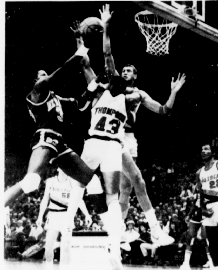
Portland Trail Blazers keep Patrick Ewing busy in 110-96 victory over N.Y. Knicks.

Saturday night the Blazers embarrassed the Jazz with a win of 128-108. In that game, forward Kiki Vandewegh and guard Clyde Drexler combined for 47 points. Drexler also