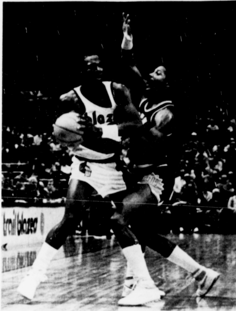
Portland Trail Blazers won 128-123 in overtime in season opener.

Ewing's efforts, although good, weren't better than all-pro Sixers' center Moses Malone. Malone had 35 points, 13 rebounds and three blocked shots.