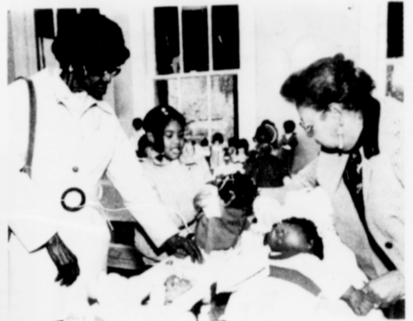
Saturday at IFCC brought together young and old to see "the largest single sale and exhibit of Black dolls in this area. There were dolls in every hue, size and made of many different materials. Prices ranged from $2.50 to several hundred dollars. Dolls on exhibit came from Florida, South Carolina, Ohio, Washington, Texas, California and Oregon. If you missed the exhibit, the next stop on the tour will be at Seattle Center on Oct. 26 and will end Nov. 2 in Houston, Texas.

Nancy Wilson will be appearing at the Arlene Schnitzer Concert Hall on Nov. 22 at 8:00 p.m.