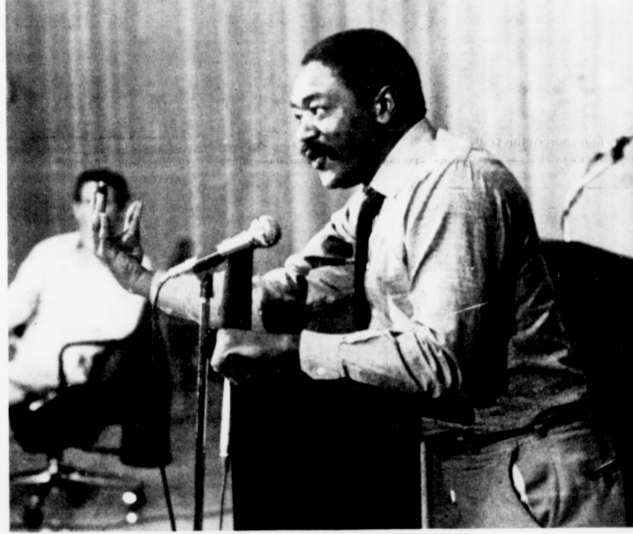
Bobby Seale, co-founder of the Black Panther Party - "Constructive engagement is B--I S--t.

Seale asked Pringle if he expects the world to sit back and do nothing while Blacks are being shot down by the