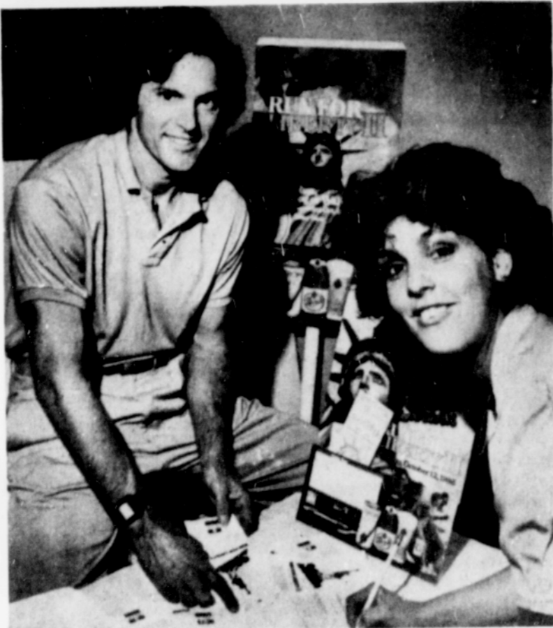
Bruce Jenner registers the first runner for the Run for Liberty to be held October 12 in 127 cities.