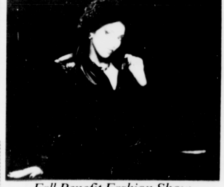
Fall Benefit Fashion Show

Saturday, October 5, 1985 7 p.m.: No-Host Cocktail