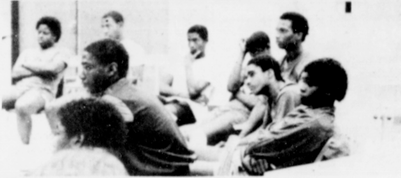
Judging by their facial expressions, emphasizing the importance of academics in the classroom was not lost on these senior campers.