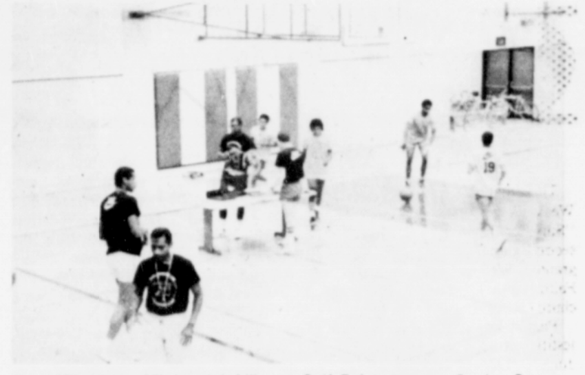
The 1985 Albina Ministerial Alliance Self Enhancement Senior Camp preparing for a day's work. Film study and basic fundamentals were first on the agenda.