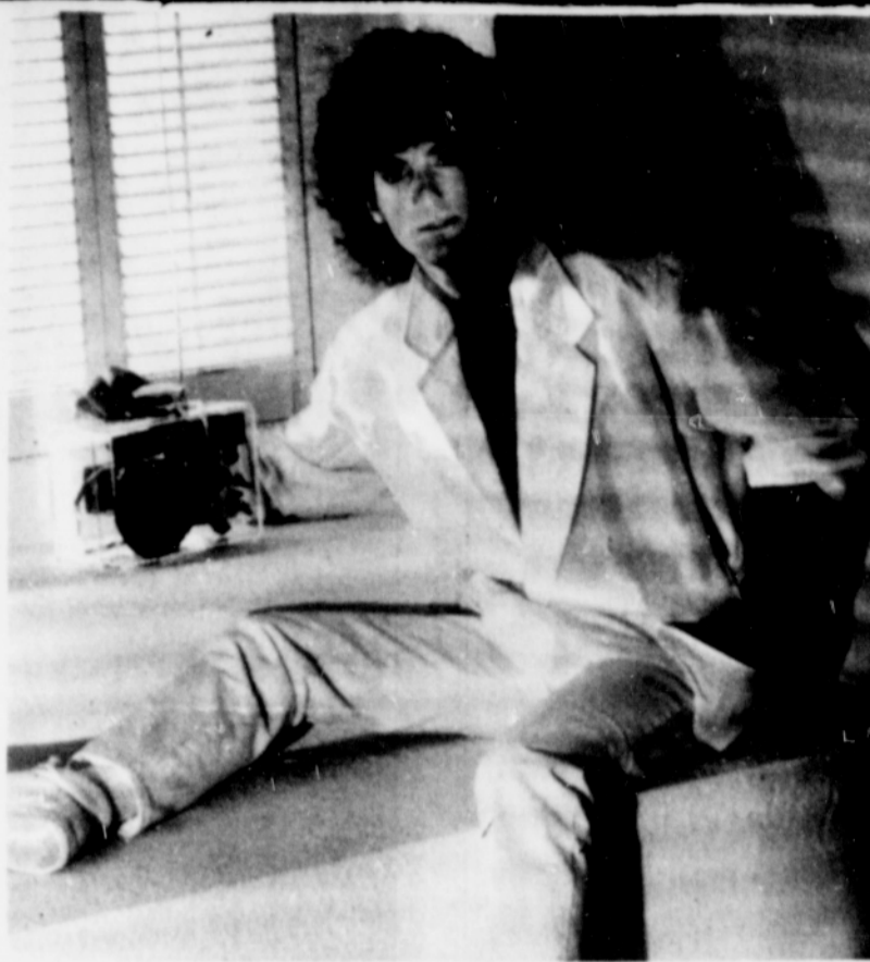
Kenny G will be appearing along with George Benson at the Arlene Schnitzer Concert Hall on May 24 in two shows, 7:00 and 10:00 p.m., and May 25 at 8:00 p.m.

Talking Drum Bookstore 1634 N.E. Alberta 282-9465