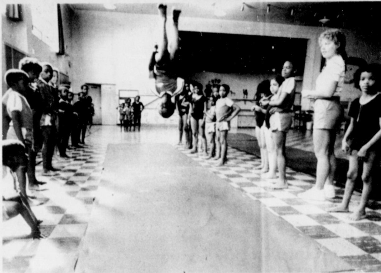
Two views of the King School tumbling team. the only one of its kind at the elementary level.

Richey said her first tumbling team had 17 boys and three girls, but now there are more girls than boys. "The girls tend to do more flex moves and the boys tend to do more muscle moves," she said.